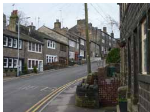
Top: Bronte Parsonage Museum, Haworth Middle: Oxenhope Railway Station Bottom: Oakworth

4.4.5 The Pennine Villages of Oakworth, Oxenhope, Harden, Wilsden, Cullingworth and Denholme have retained their individual characters and sense of place whilst seeing a smaller scale of housing development and the provision of amenities served by improved bus and rail links to Keighley town centre, Bradford City Centre, Bingley, Queensbury and neighbouring Halifax.